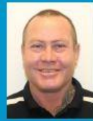
Shaun Neilan Construction