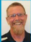
Rob Reid Construction