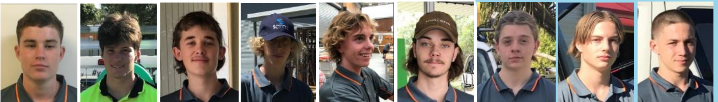
Tom Automotive Zac Plumbing Riley Tiling Tom Cabinetry Hayden Refrigeration Kai Engineering Tom Electrical Tom Plumbing Zayne Electrical