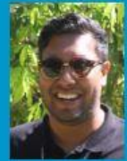
Aaron Aviation Australia