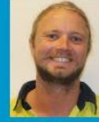
Mitchell Love Electrotechnology